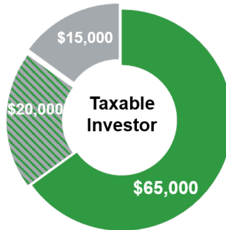
Income After Recovery